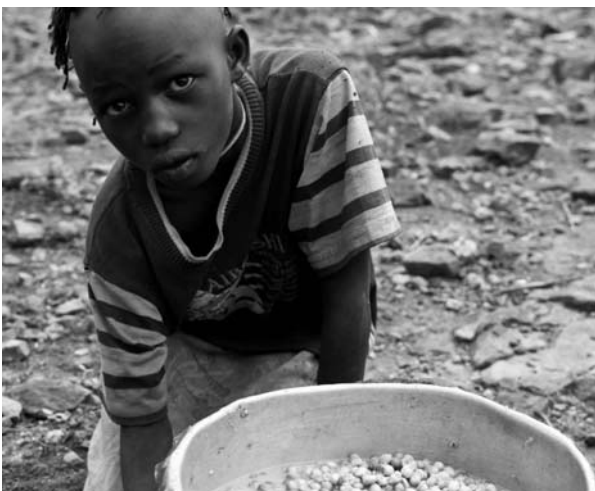
Chelimo's search for food in a land of dust

Taking learners through a three-step process, Ready, Steady, Go! it gives opportunities to learn what is at stake through understanding specific problems from around the world.