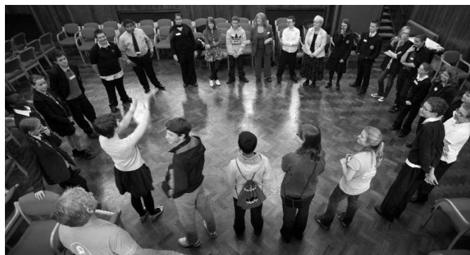
Students role play characters from Malawi affected by climate change