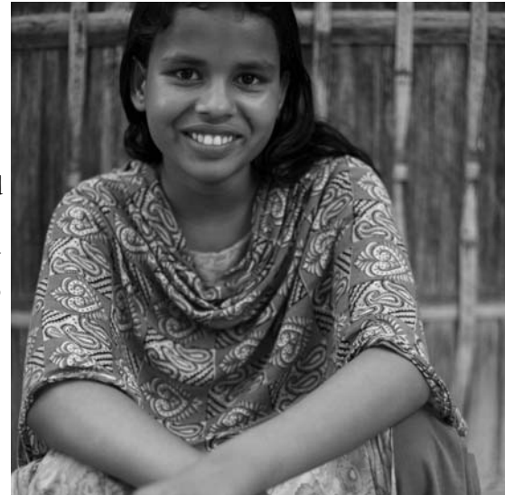
Floods have destroyed bobita's home and crops

hundred months if we are to have any chance of staying below a 2oC global rise in temperature. Beyond a 2oC rise we risk moving into the realms of runaway climate change and if we maintain our current output of greenhouse gases it is predicted to be a four degree rise, with some predictions rising to six.